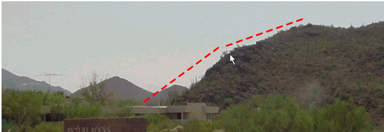
Photo facing southwest from Picture Rocks Rd.

Peaks & Ridges candidate no. 167 General Location Picture Rocks & Pima Mine Rd Parcel Numbers 214150060 etc. _____