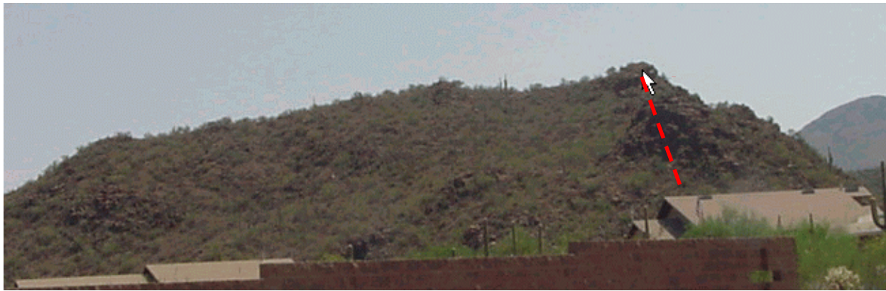
Photo facing south from Picture Rocks Rd.

Peaks & Ridges candidate no. 166 General Location Picture Rocks & Yuma Mine Rd. Parcel Numbers 214150040 etc.