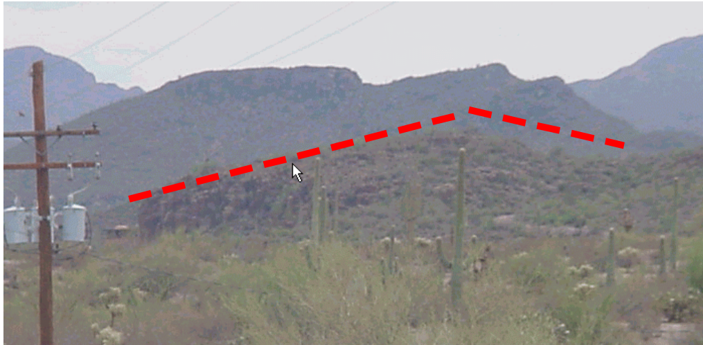
Photo facing south from Picture Rocks Rd.

Peaks & Ridges candidate no. 165 General Location Picture Rocks & Yuma Mine Rd. Parcel Numbers 214150090 etc.