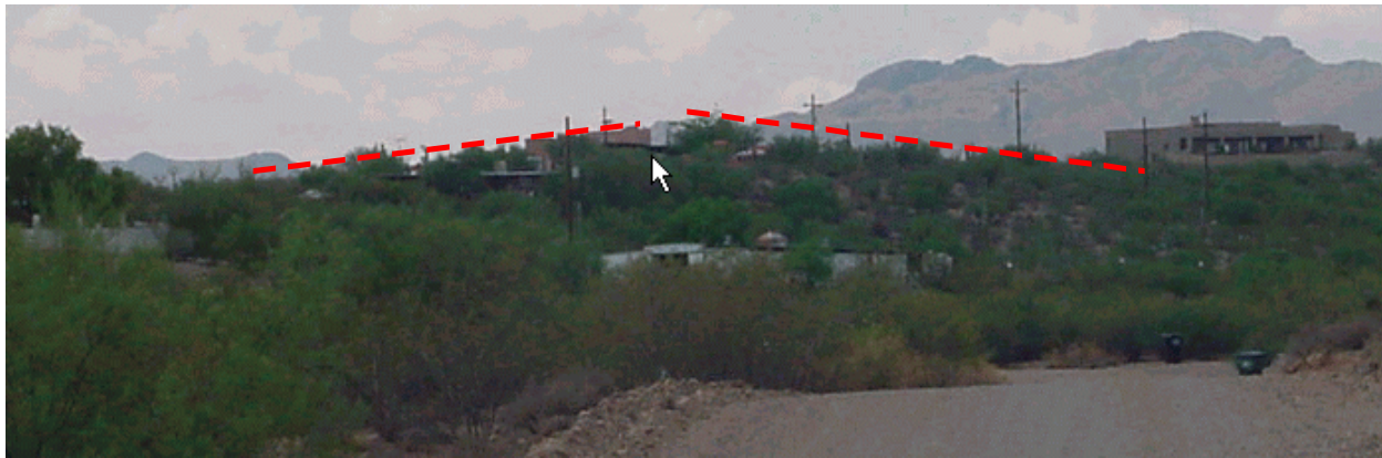
Photo facing southwest from Desert Foothills Dr.

Peaks & Ridges candidate no. 159 General Location Desert Foothills Dr & Desert Willow Dr. Parcel Numbers 214180330 etc.