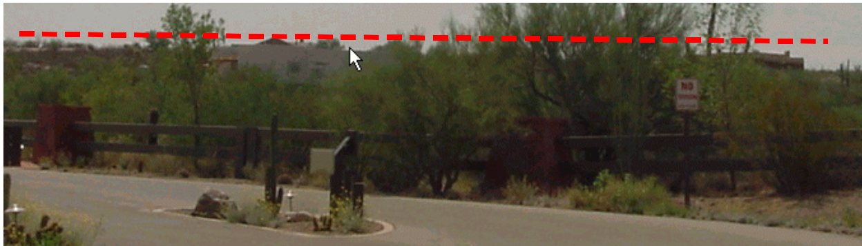
Photo facing southeast from Abington Rd.

Peaks & Ridges candidate no. 158 General Location Abington Rd & Tucson Mountain Dr. Parcel Numbers 214180740 etc.