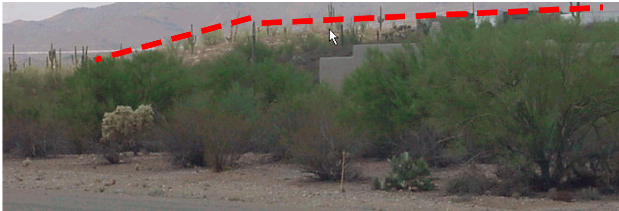
Photo facing southwest from Abington Rd.

Peaks & Ridges candidate no. 157 General Location Abington Rd. & Crystal Valley Ct. Parcel Numbers 214180060 etc.