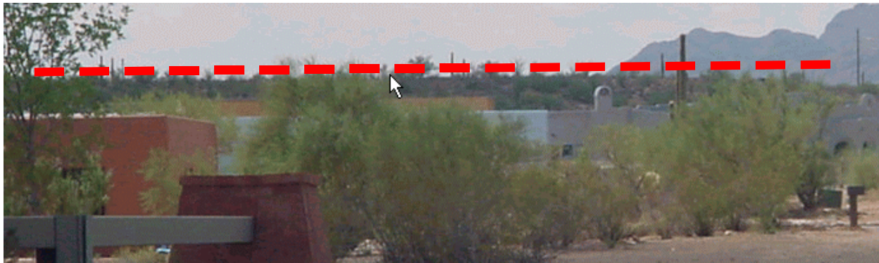
Photo facing south from Abington Rd.

Peaks & Ridges candidate no. 156 General Location Abington Rd. & Crystal Valley Ct. Parcel Numbers 214180810_etc.