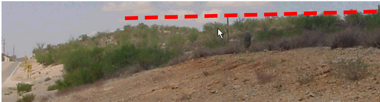
Photo facing northwest from Sunset Rd.

Peaks & Ridges candidate no. 152 General Location Sunset Rd. & Tucson Mtn. Dr. Parcel Numbers 214180550 etc.