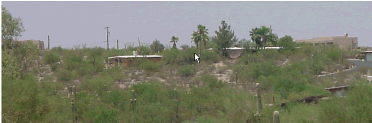
Photo facing northwest from Sunray and Sunset Rd.

Peaks & Ridges candidate no. 151 General Location Sunset Rd & Blue Bonnet Rd. Parcel Numbers 214220310 etc.