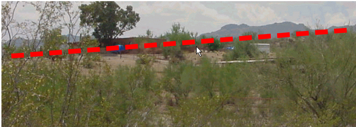
Photo facing southwest from Sunset Rd.

Peaks & Ridges candidate no. 150 General Location Sunset Rd. & Blue Bonnet Rd. Parcel Numbers 21423227A etc.