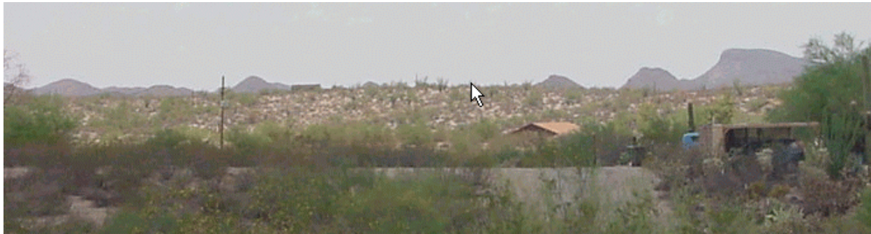
Photo facing west from Camino de Oeste.

Peaks & Ridges candidate no. 149 General Location Sunset Rd. & Camino de Oeste Parcel Numbers 214232220 etc.