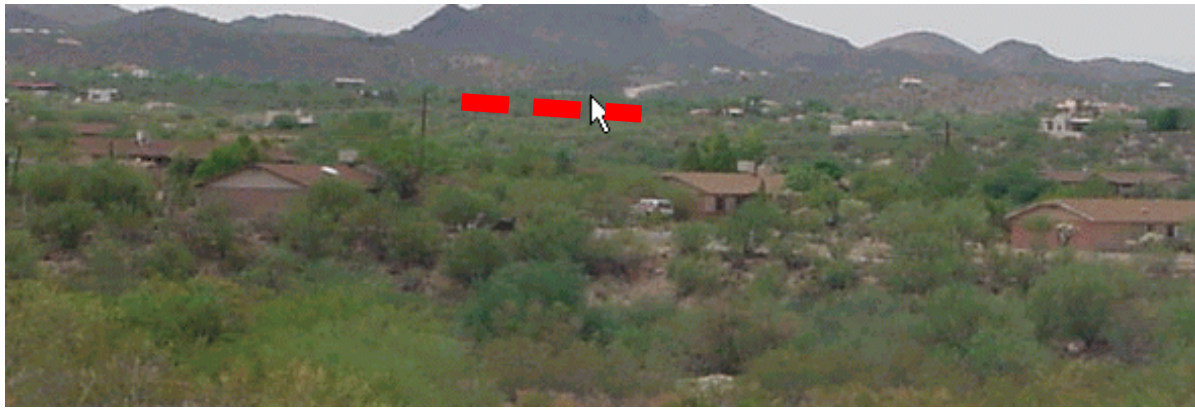
Photo facing west from north end of Tortillita Rd.

Peaks & Ridges candidate no. 148 General Location Blue Bonnet Rd. & Calle Montuoso Parcel Numbers 2142805011 etc.