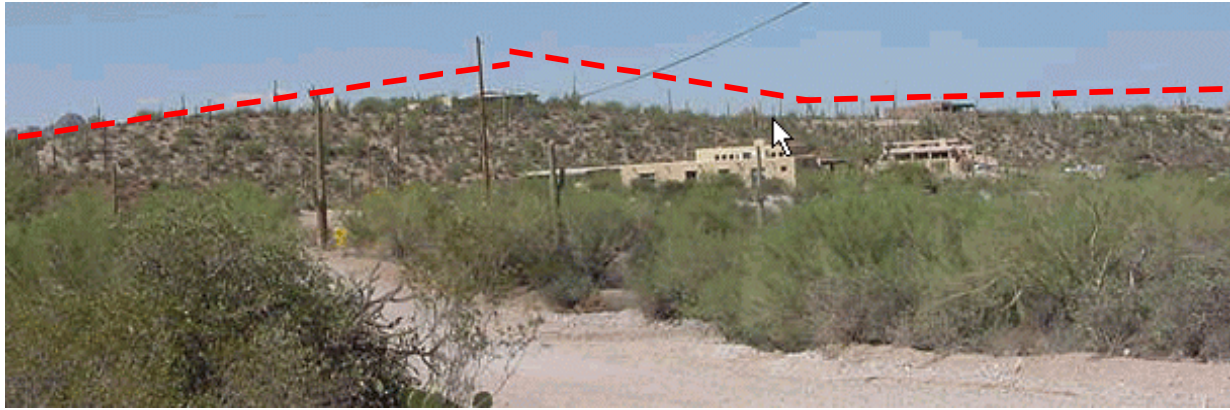
Photo facing west along Sunset Rd.

Peaks & Ridges candidate no. _____147_____ General Location ___ West Sunset Rd. _____ Parcel Numbers ___ 21434005C etc. _____