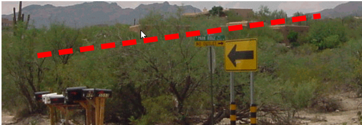
Photo facing southwest from Sunset/Park Ridge Rd.

Peaks & Ridges candidate no. 146 General Location Sunset Rd. & Diamond St. Parcel Numbers 21434004G etc.