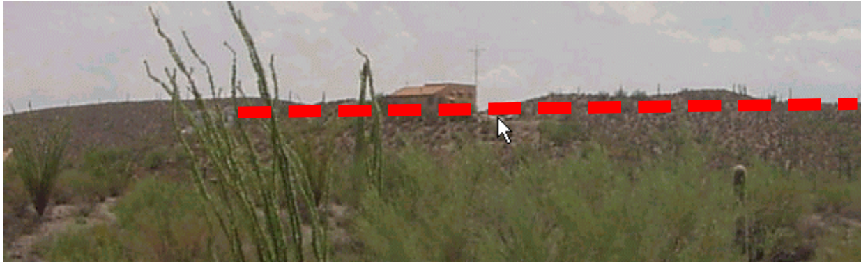
Photo facing south from Azure Hills Dr.

Peaks & Ridges candidate no. 143 General Location Sunset Rd. & Azure Hills Parcel Numbers 21437024B etc. _____