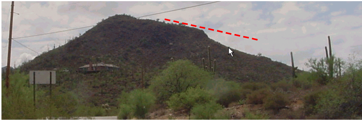
Photo facing west from El Camino del Cerro.

Peaks & Ridges candidate no. 139 General Location El Camino del Cerro & Avenidados Vistas Parcel Numbers 21439019H