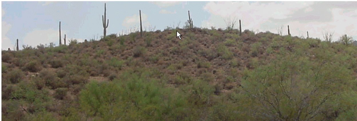
Photo facing south from Camino del Cerro.