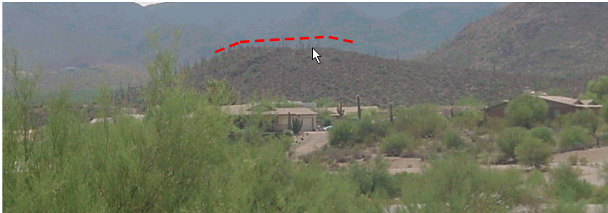
Photo facing west from Tortolita Rd.