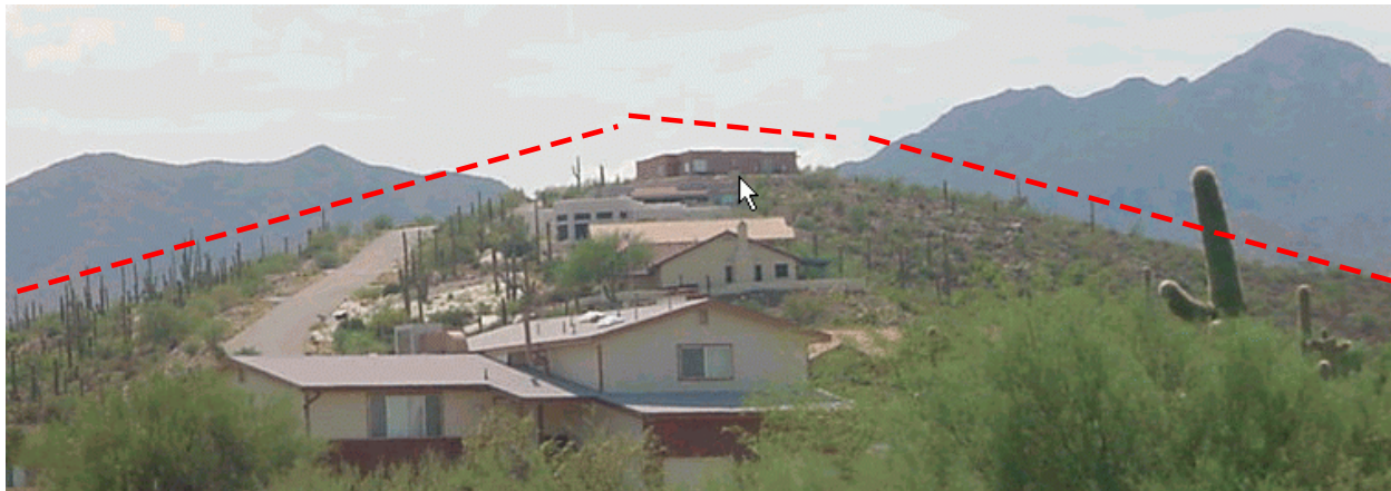
Photo facing west from Tortolita Road.

Peaks & Ridges candidate no. 136 General Location West end of Paseo de las Estrellas Parcel Numbers 214414270 etc.