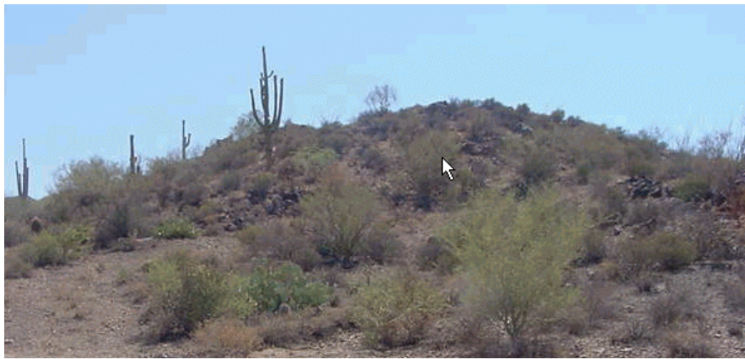
Photo taken from El Camino del Cerro.