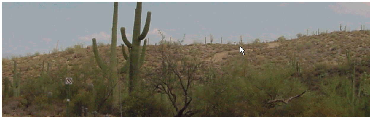
Photo facing east from Camino del Cerro trail-head parking area.