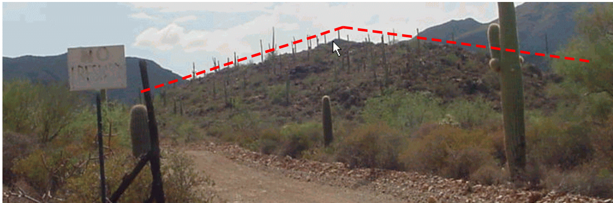
Photo facing southwest from Broken Spring Tr.

Peaks & Ridges candidate no. 132 General Location End of Broken Springs Trail Parcel Numbers 214390310 etc.