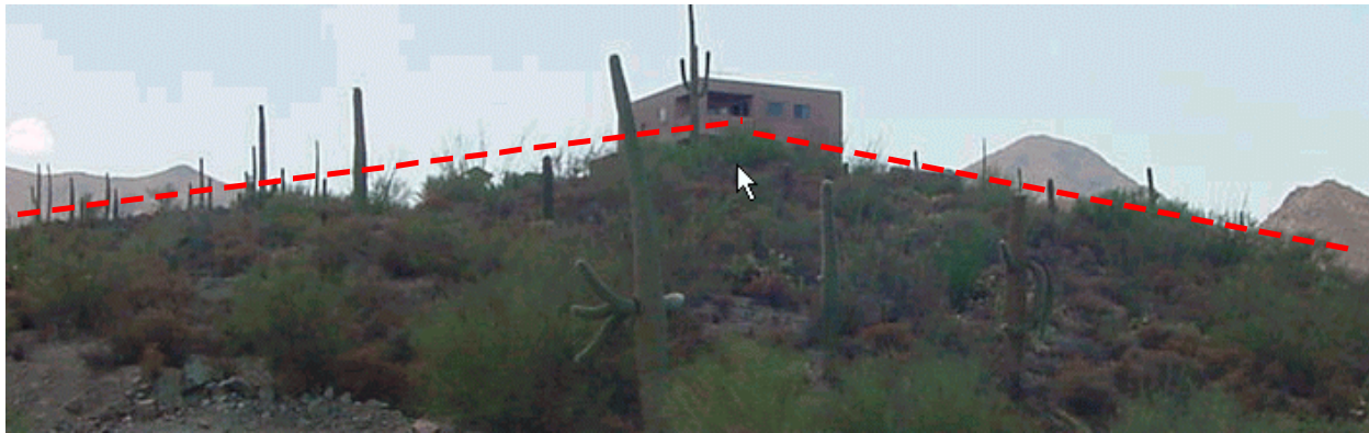
Photo facing southwest from Wasson Vista Dr.

Peaks & Ridges candidate no. 128 General Location Wasson Vista Dr. Parcel Numbers 214500100 etc.