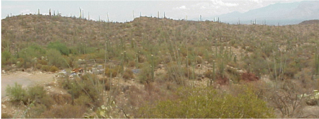
Photo facing northeast from the end of Sweetwater drive

Peaks & Ridges candidate no. ___ 127B _____ General Location __ West end of Sweetwater Drive _____ Parcel Numbers __ 214500210 etc. _____