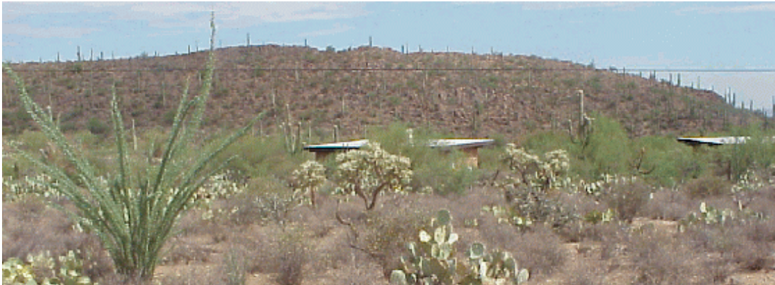
Photo facing north from Sweetwater Drive west of Blue Bonnet Road

Peaks & Ridges candidate no. 126 General Location Sweetwater Drive west of Blue Bonnet Road Parcel Numbers 214500540 etc.