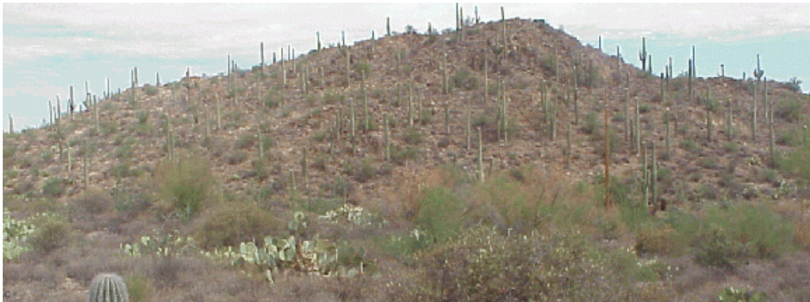
Photo facing north from Sweetwater Drive west of Blue Bonnet Road