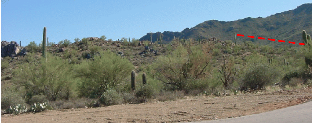
Photo facing south from Sweetwater Drive

Peaks & Ridges candidate no. 123 General Location Southwest of Sweetwater Drive & Blue Bonnet Road Parcel Numbers 214532190 etc.