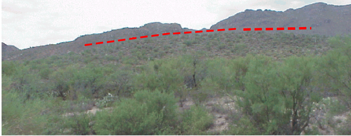
Photo facing south from Sweetwater Drive west of Blue Bonnet drive.