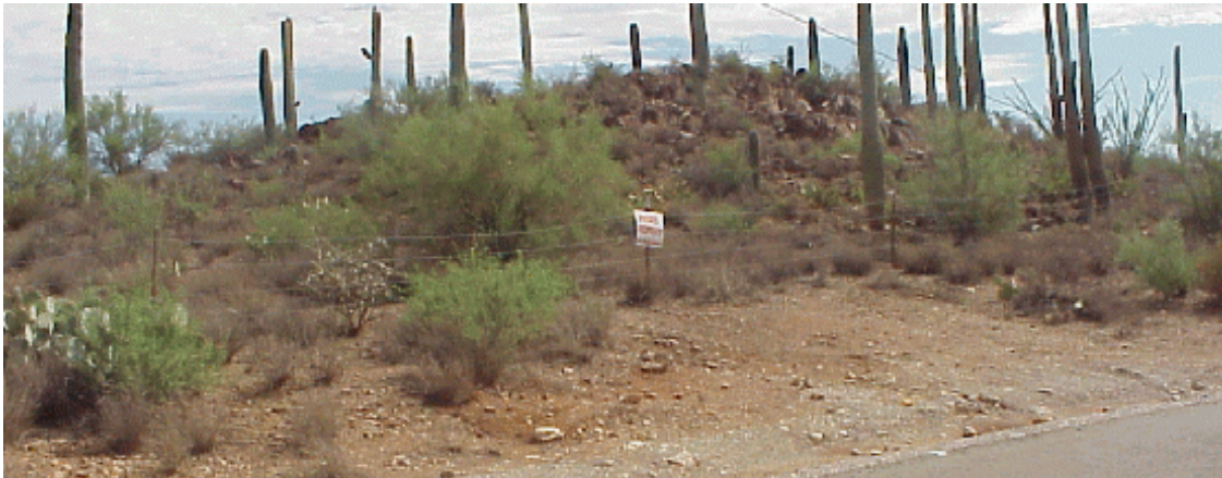
Photo facing northeast from Sweetwater Drive west of Blue Bonnet Road.