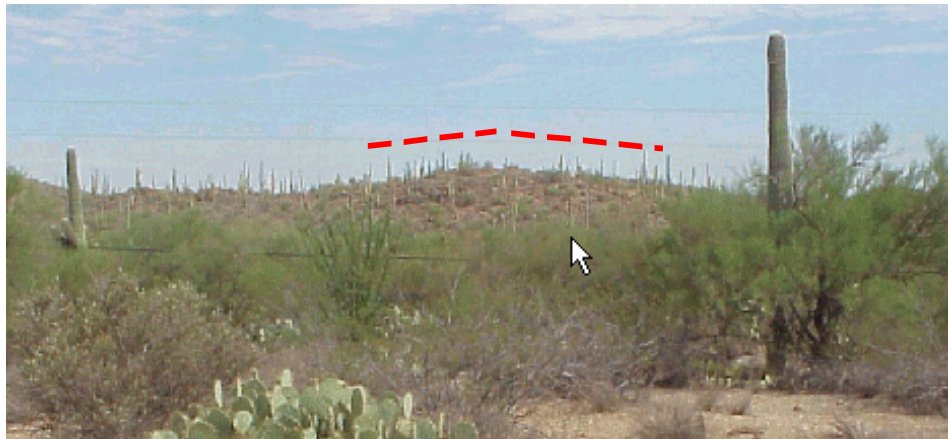
Photo facing north from Sweetwater Drive west of Blue Bonnet Road