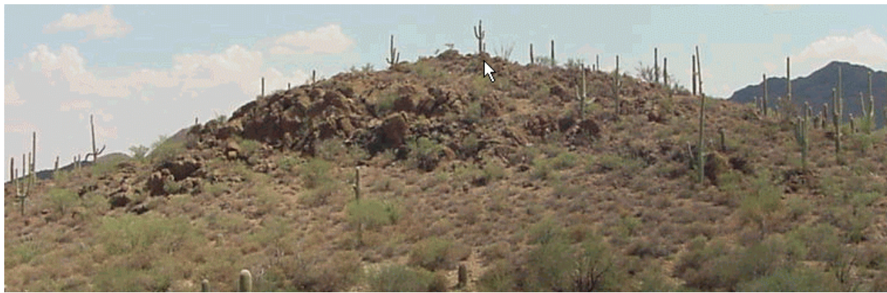
Photo facing south from Bucking Bronco Pl.