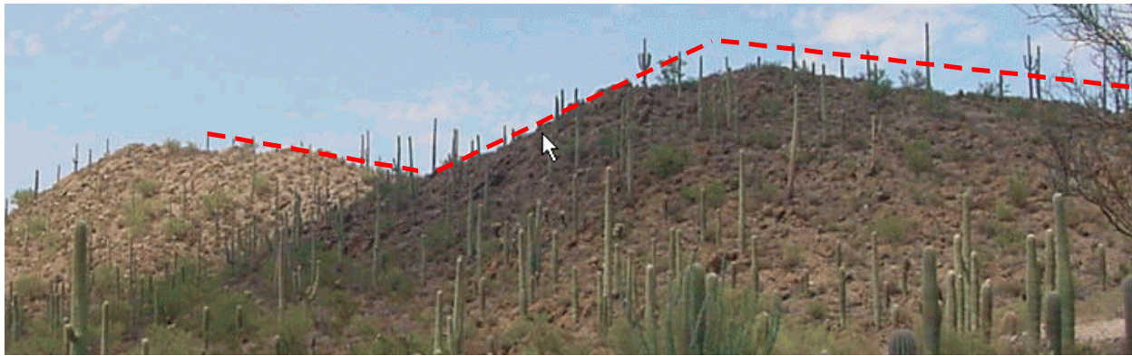
Photo facing northwest from Bucking Bronco Pl.

Peaks & Ridges candidate no. 110 General Location Bucking Bronco Pl. Parcel Numbers 21450002E etc.