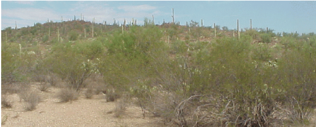
Photo facing northwest from Sweetwater Drive west of Blue Bonnet drive.

Peaks & Ridges candidate no. 104B General Location Sweetwater Dr. & Blue Bonnet Dr. Parcel Numbers 21449034A