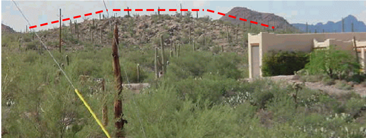
Photo facing north from Sweetwater Drive & Blue Bonnet Road.