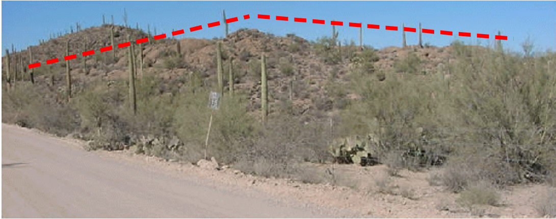
Photo facing northwest from Sweetwater Drive & Blue Bonnet Rd.

Peaks & Ridges candidate no. 102 General Location Sweetwater Drive & Blue Bonnet Road Parcel Numbers 21449034A