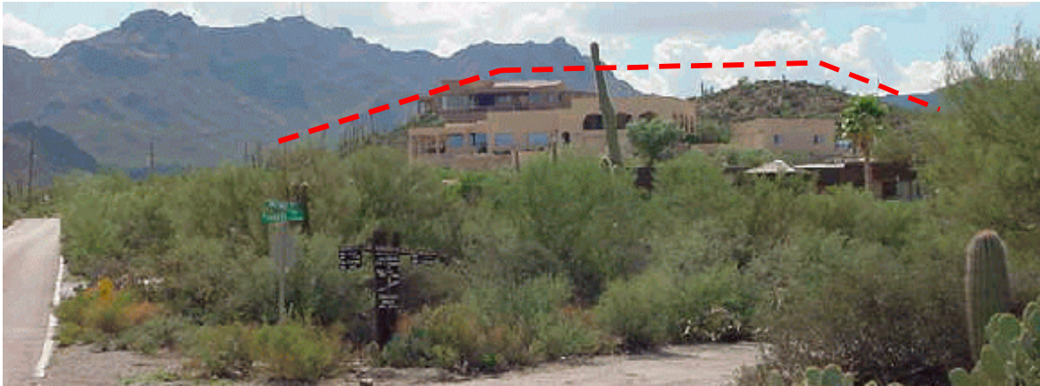
Photo facing west from Sweetwater Drive & Arroyo Place

Peaks & Ridges candidate no. 100 General Location Camino De Oeste & Blue Bonnet Drive Parcel Numbers 21447029A etc.