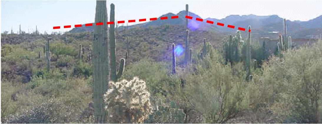
Photo facing southwest from Sweetwater Drive.