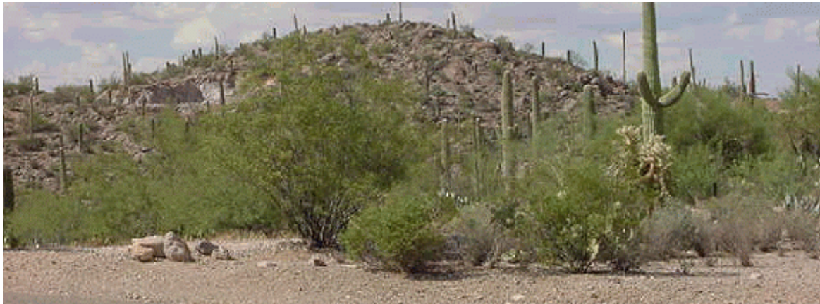
Photo facing northwest from Lazy C Circle

Peaks & Ridges candidate no. 98 General Location Lazy C Circle west of Camino De Oeste Parcel Numbers 214470450 etc.