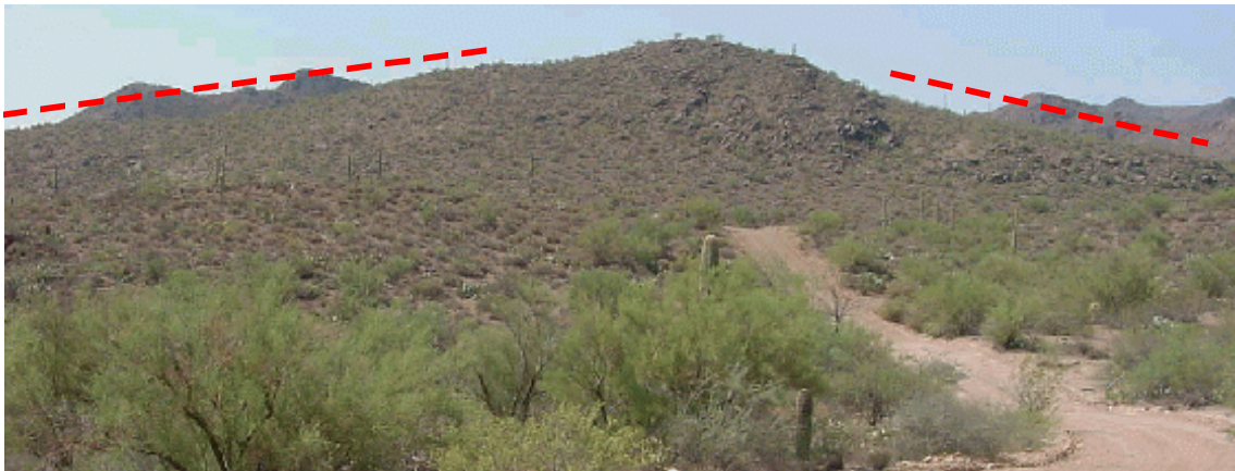
Photo facing south from end of Lazy C Drive