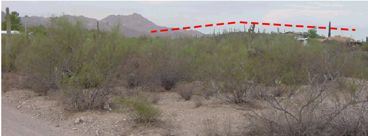
Photo facing west from Rhyolite loop

Peaks & Ridges candidate no. 94 General Location Rhyolite Loop & Lazy C Drive Parcel Numbers 21455027D etc.