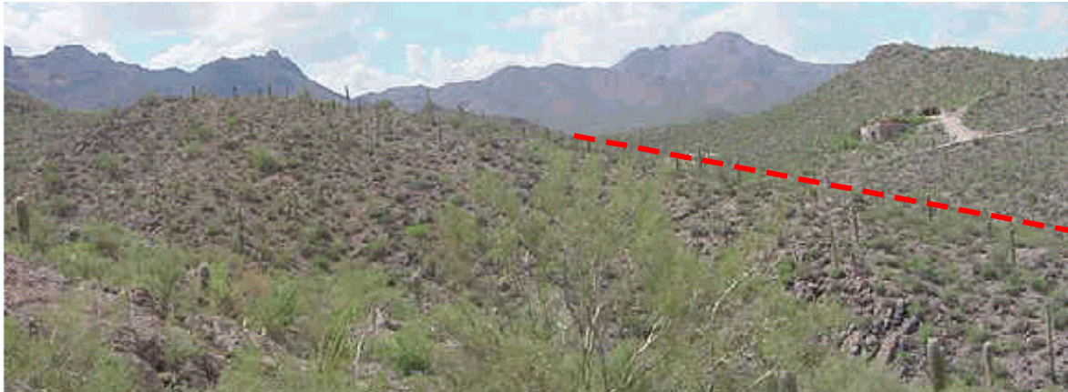
Photo facing northwest from Crest View Drive

Peaks & Ridges candidate no. 93 General Location Northwest of Camino De Oeste & Ironwood Hill Dr. Parcel Numbers 214550450 etc.