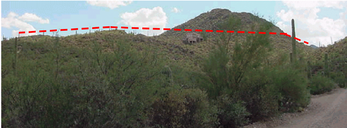
Photo facing southwest from Rhyolite Loop