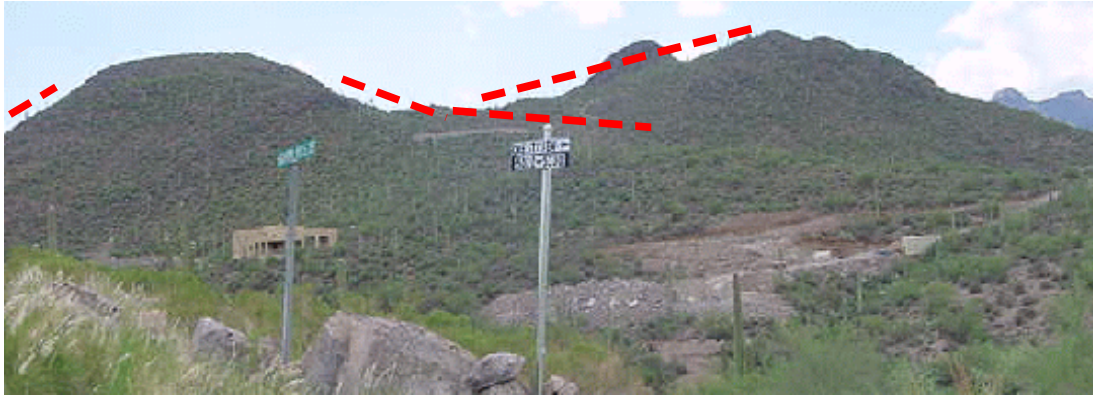
Photo facing southwest from Crest View Drive

Peaks & Ridges candidate no. ___ 88 _____ General Location __ Northwest of Camino De Oeste & Ironwood Hills Drive ___ Parcel Numbers __ 21455049B etc. _____