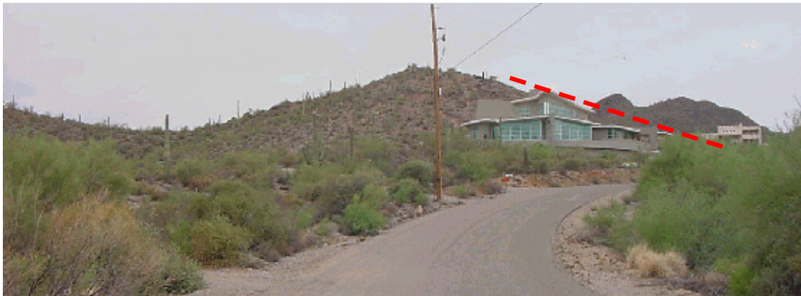
Photo facing southwest from Sundance Way

Parcel Numbers 214560920, 214561030 & 214561040