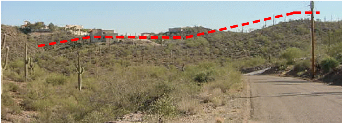
Photo facing southeast from Crest View Drive

Peaks & Ridges candidate no. 85 General Location Camino De Oeste & Ironwood Hill Dr. Parcel Numbers 214560890, 214560900 & 214560910