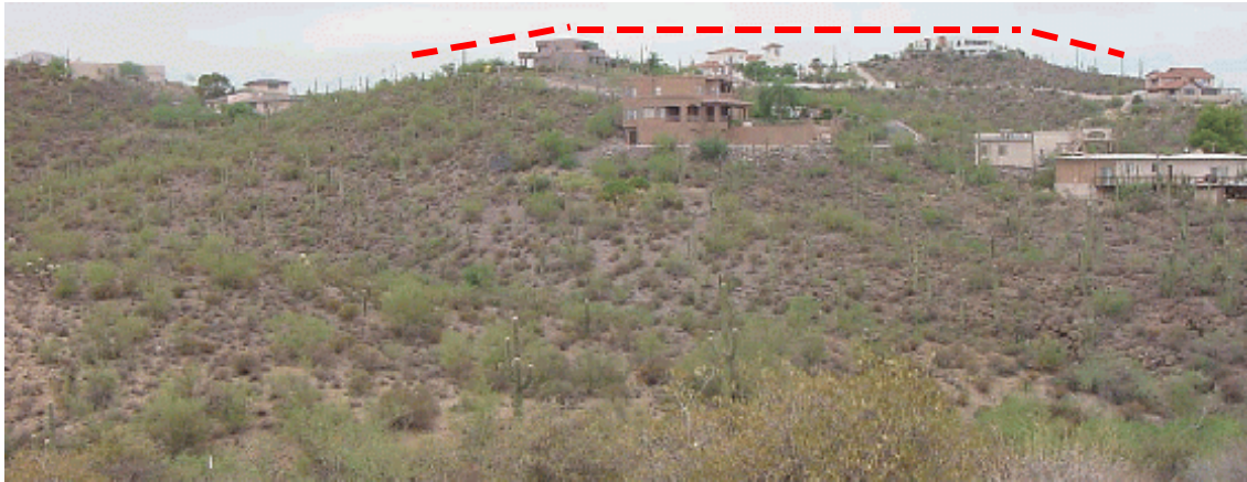
Photo facing northwest from Camino De Oeste south of Ironwood Hill Drive

Peaks & Ridges candidate no. 81 General Location 214560460 etc. Parcel Numbers Camino De Oeste & Ironwood Hill Drive