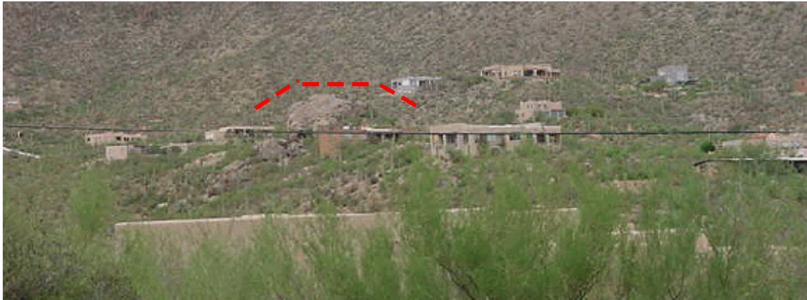
Photo facing northwest from Lost Canyon Drive

Peaks & Ridges candidate no. 78 General Location Lost Canyon Drive & west end of Trails End Road Parcel Numbers 212070430 etc.