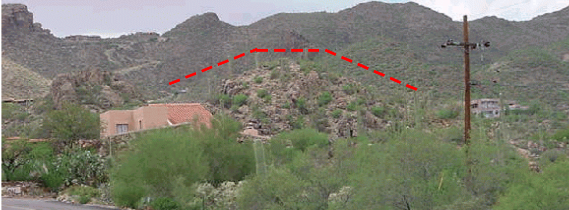
Photo facing west from Lost Canyon Drive

Peaks & Ridges candidate no. 77 General Location Lost Canyon Drive & west end of Trails End Drive Parcel Numbers 212070340 etc.