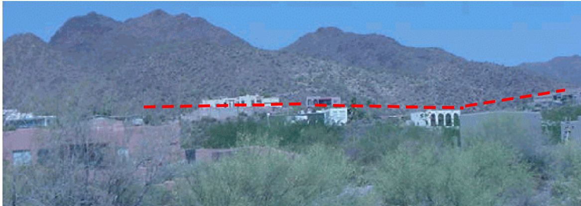
Photo facing northwest from Gates Pass Road

Peaks & Ridges candidate no. 74 General Location Gates Pass Road west of Camino De Oeste Parcel Numbers 212120610, etc.