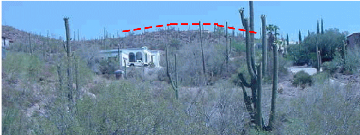
Photo facing northwest from Gates Pass Road

Peaks & Ridges candidate no. 73 General Location Gates Pass Rd. west of Camino De Oeste Parcel Numbers 21212017A etc.